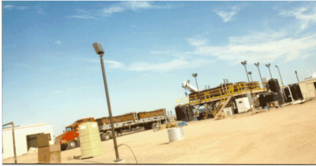
PILOT AND SMALL COMMERCIAL SYSTEMS