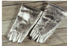
Fully Aluminized Glove Ideal for jobs that call for radiant heat reflection for the entire hand. 14" long (36cm). Available in packs of 1 pair.