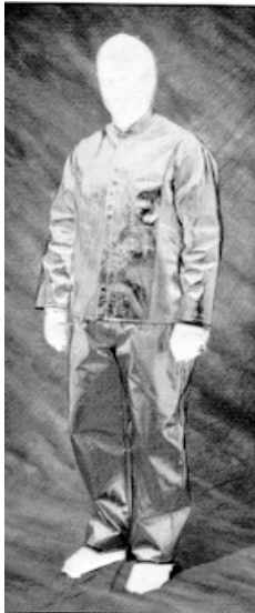
Coat and Pants Aluminized coat and pants to protect torso, arms and legs from hot splashing metals and radiant heat. Pants have reinforced waistband and flame retardant liner.