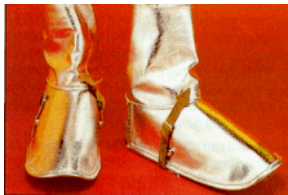
Spats Aluminized protection for shoes, features heavy stitching on areas heavily exposed to heat.