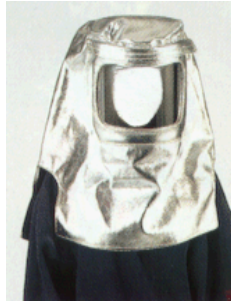
Aluminized Hood This hood incorporates a welder's helmet or hard hat with adjustable ratchet for sizing. It includes protection over shoulders with a bib offering protection to upper chest and neck.