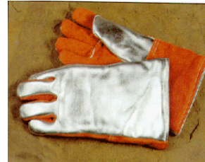
Aluminized Back Glove With durable, heat resistant cowhide palm. Aluminized 1-piece back reflects radiant heat. 14" long (36cm). Available in packs of 1 pair.