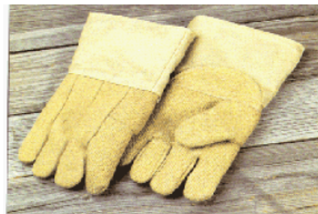
Heavy-duty PBI Gloves and Mitts. Double wool-lined palms. Provide protection at temperatures up to 927°C (1700°F). Ideal for foundry work, metal curing and refining, aluminum extrusion, and welding. Available in packs of 1 pair.