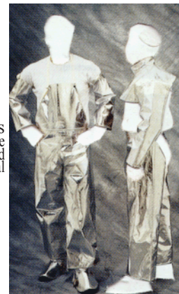
Cape Sleeves Aluminized sleeves to provide full arm protection. Can be used with bib chaps to obtain frontal